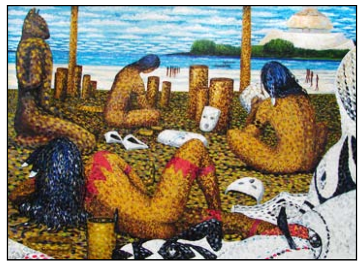
On Marco: The Mask Makers by artist Jonathan Green

March 13, 6 pm African American Experience in Florida: The Rosewood Incident, Mid-County Regional Library, Meeting Room C, 2050 Forrest Nelson Blvd, Port Charlotte. Reservations required. Rosewood, Florida was an African American village in western Levy County that was