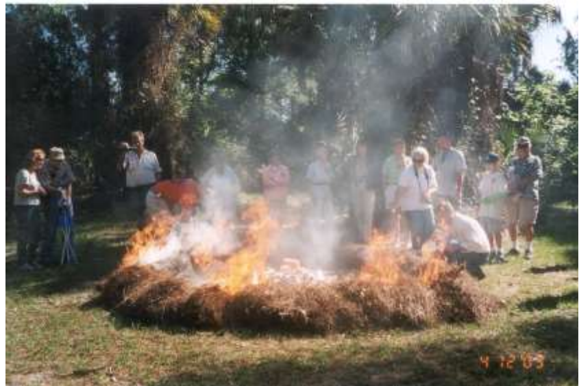
The fire has been spread completely around the ring of brush and tinder to start the firing process