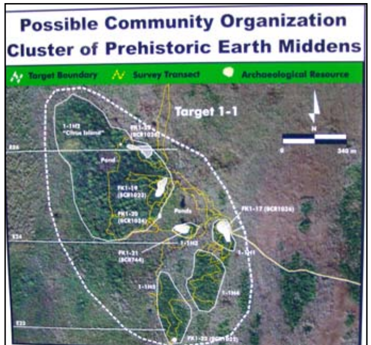
The sites investigated included 8CR544, 8CR744, 8CR1023, 8CR1024, 8CR1025 and 8CR1031.